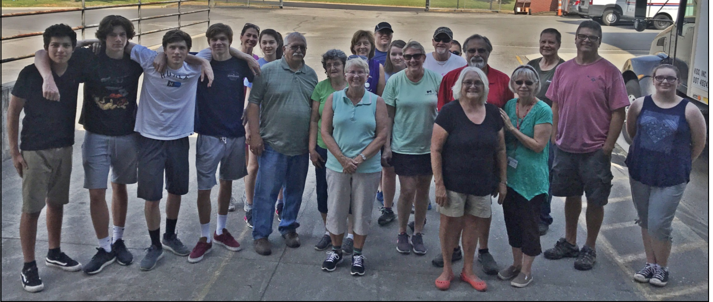
Twenty five volunteers from Agape helped with the Annual Postal Food Drive at the Cave Spring Post Office, qualifying Agape to receive 1000 pounds of food from the food bank, Feeding America Southwest Virginia.