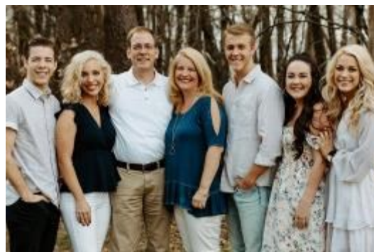
The Hofheinz Family