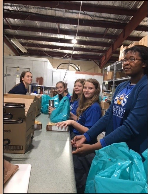
Students from Heritage Christian Academy, Rocky Mount (above) and Smith Mountain Lake Christian Academy, Moneta (below) provided invaluable help in not only preparing Thanksgiving bags and Christmas baskets, but helping decorate the Agape Center and providing help throughout all departments.