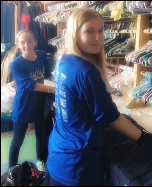
7th graders from Heritage Christian Academy in Lynchburg provided help in all departments.